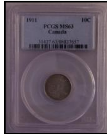
Lot 185 Canada 1911 10c PCGS MS63