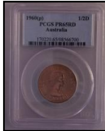
Lot 206 1960 P 1/2 Penny PCGS PR65