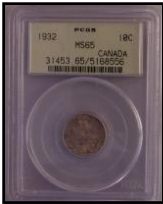
Lot 188 Canada 1932 10c PCGS MS65