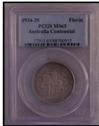
Lot 375 Centennial Florin PCGS MS65