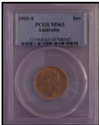
Lot 234 1910S Sovereign PCGS MS 63