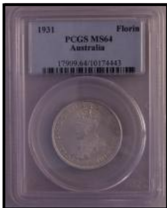
Lot 374 1931 Florin PCGS MS64