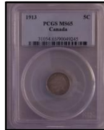
Lot 178 Canada 1913 5c PCGS MS65