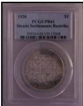
Lot 196 Straits $1 1920 PCGS PR61