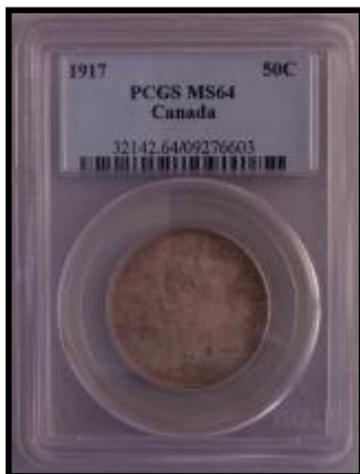
Lot 193 Canada 1917 50c PCGS MS64