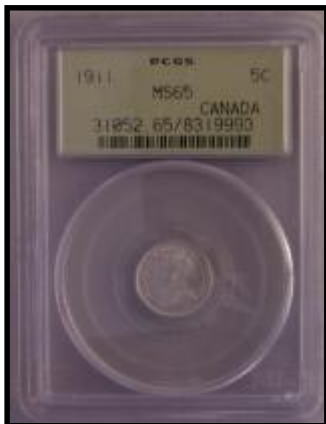
Lot 177 Canada 1911 5c PCGS MS65