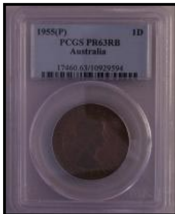
Lot 211 1955 P Penny PCGS PR64