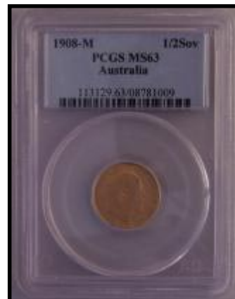
Lot 220 1908M 1/2 Sovereign PCGS MS63