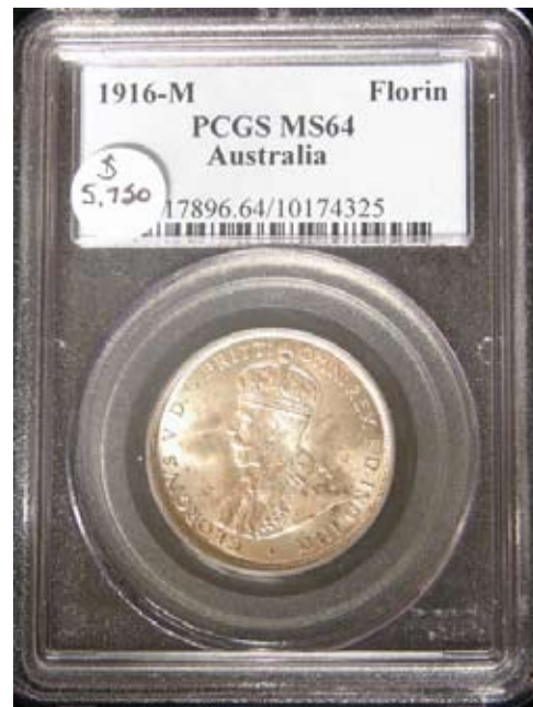
Australia 1916 Florin PCGS MS64