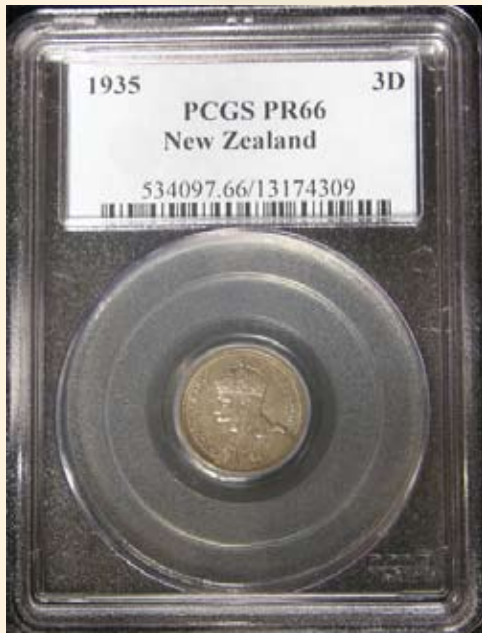
New Zealand Threepence 1935 PCGS PR66