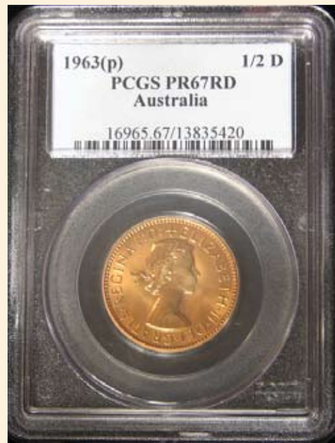
Australia 1/2D 1963P PCGS PR67