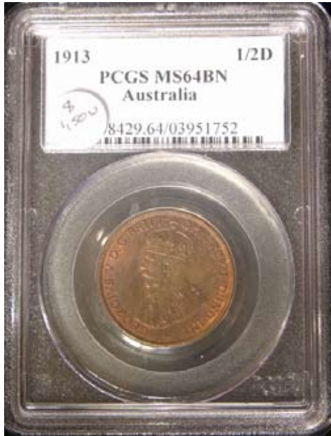
Australia 1913 1/2 Penny PCGS MS64