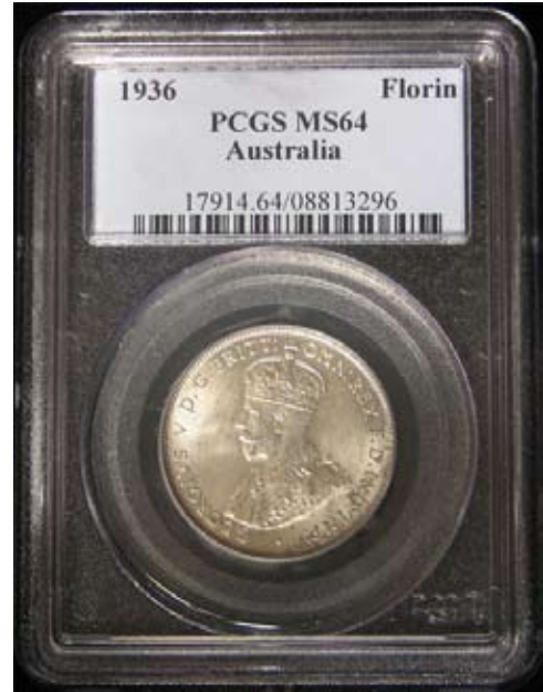
Australia Florin 1936 PCGS MS64