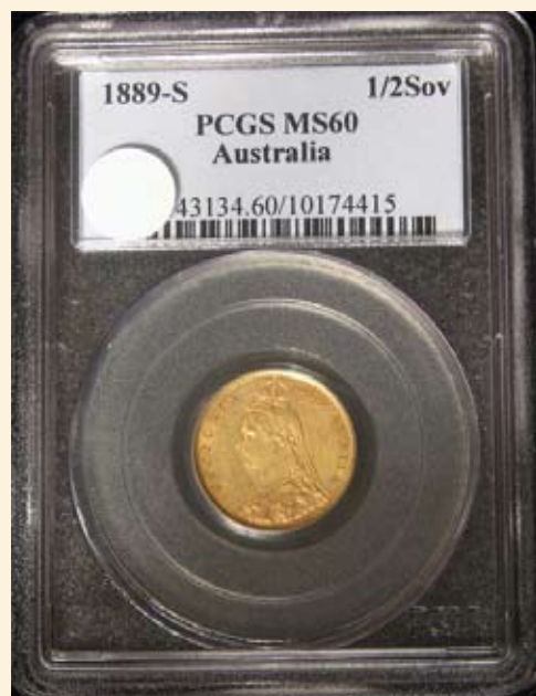
Australia 1/2 Sovereign 1889 Sydney PCGS MS60