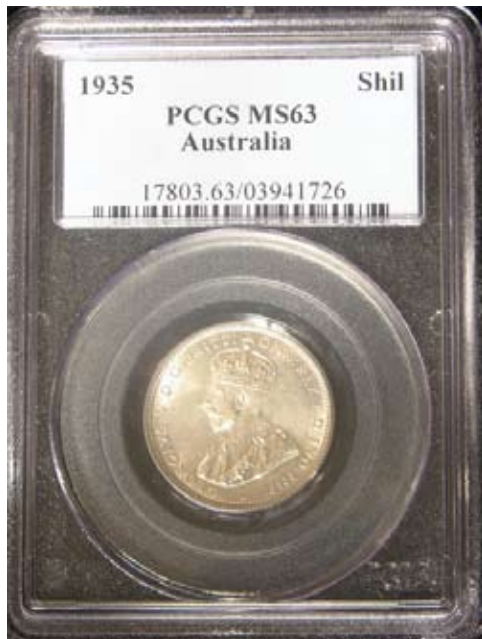
Australia 1935 Shilling PCGS MS63