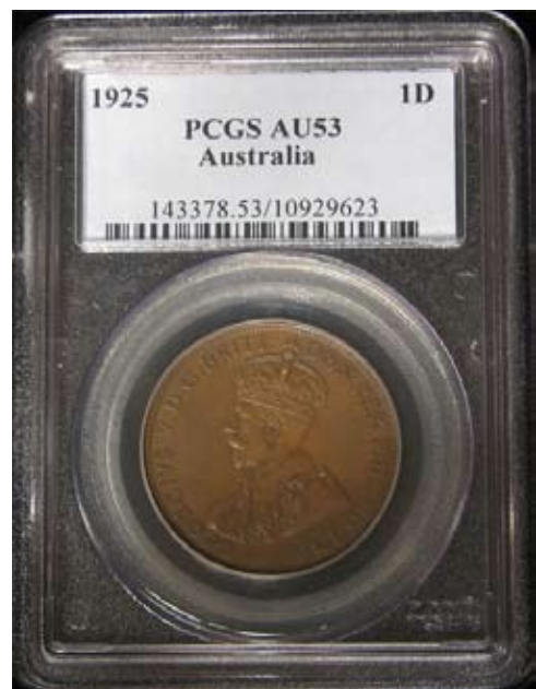
Australia Penny 1925 PCGS AU53