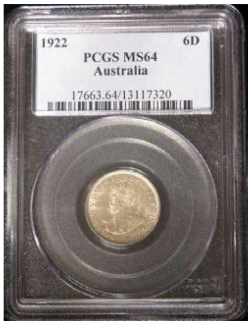
Australia Sixpence 1922 PCGS MS64