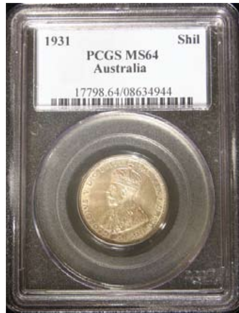
Australia 1931 Shilling PCGS MS64