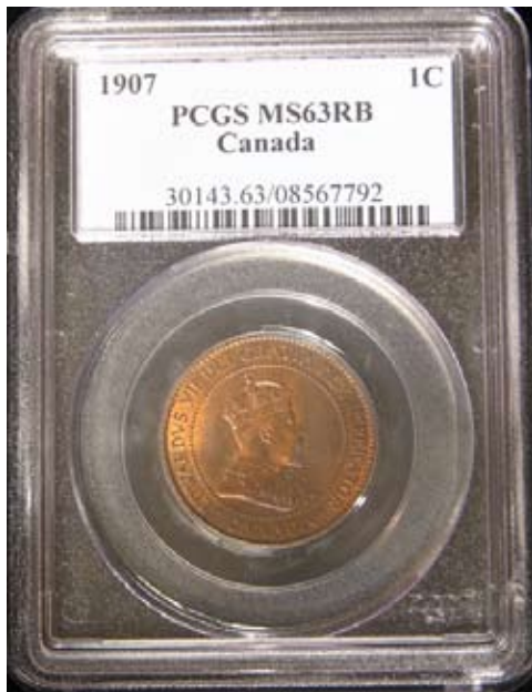
Canada 1c 1907, PCGS MS63