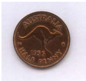
1955 Proof Halfpenny