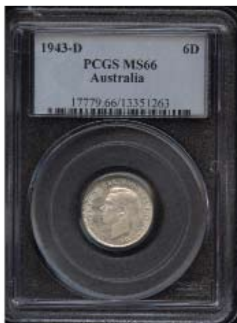
1943D Sixpence, PCGS MS66