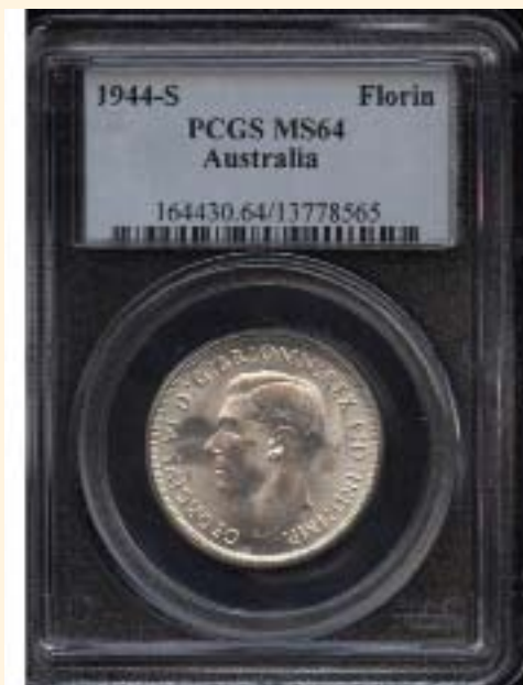
1944S Florin PCGS, MS64