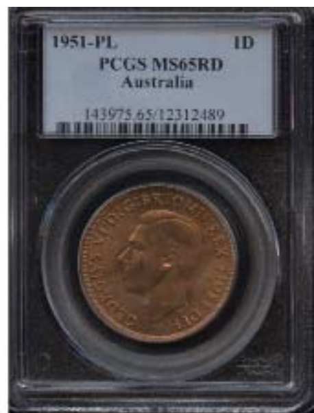
1951PL Penny, PCGS MS65 Red