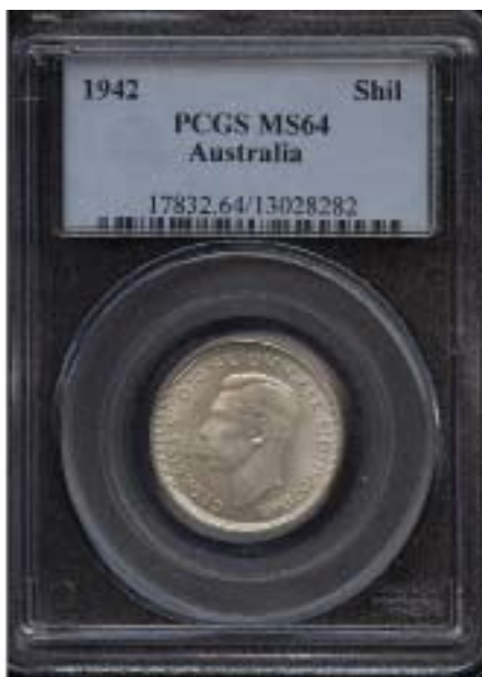
1942 Shilling, PCGS MS64