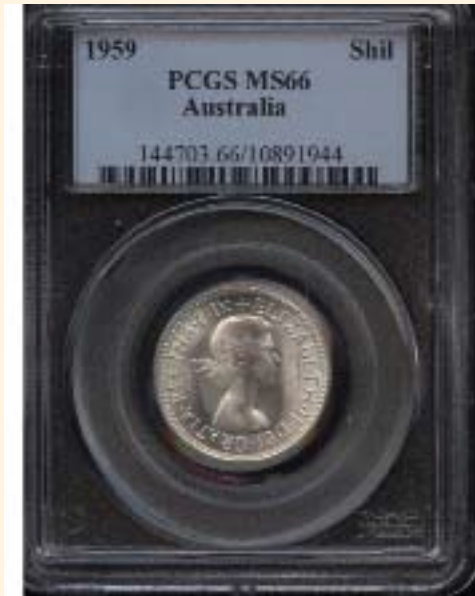
1959 Shilling, PCGS MS66