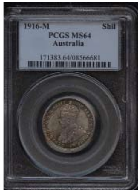
1916 Shilling, PCGS MS64