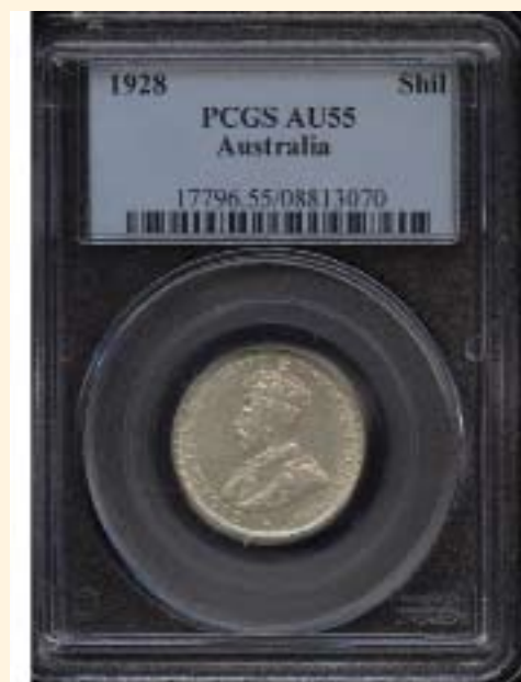
1928 Shilling, PCGS AU55