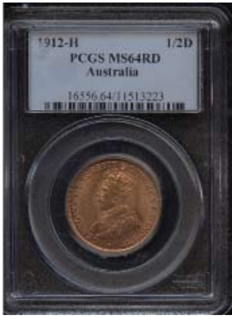
1912H Halfpenny, PCGS MS64Red