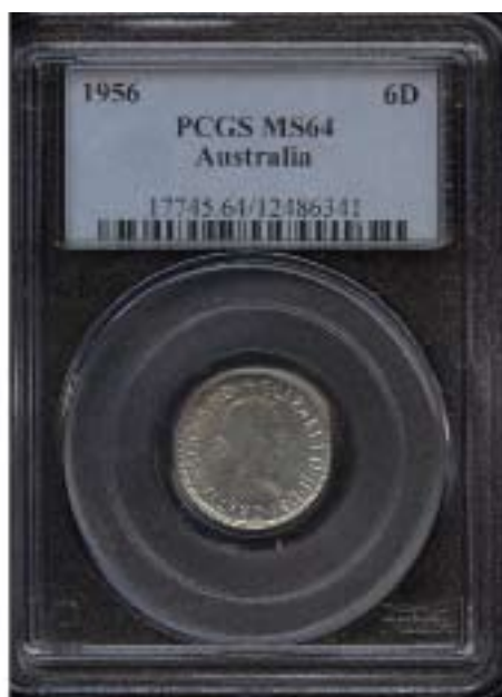
1956 Sixpence, PCGS MS64