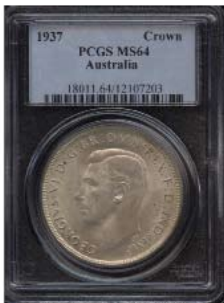
1937 Crown, PCGS MS64