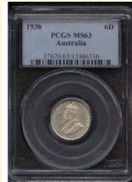
1936 Sixpence, PCGS MS63